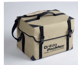
8 LITERS PAYLOAD