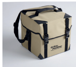
4 LITERS PAYLOAD