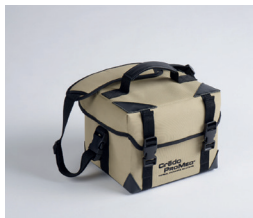
2 LITERS PAYLOAD