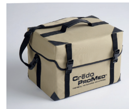
8 LITERS PAYLOAD